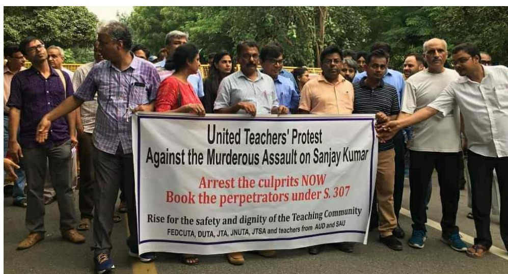
Teachers in Delhi protest against a yet another attack on a university teacher in August 2018

The RSS vision of what education should be for is, however, contested by faculty and students within universities, which then leads to a second order, physical and legal, assault on academic freedom.